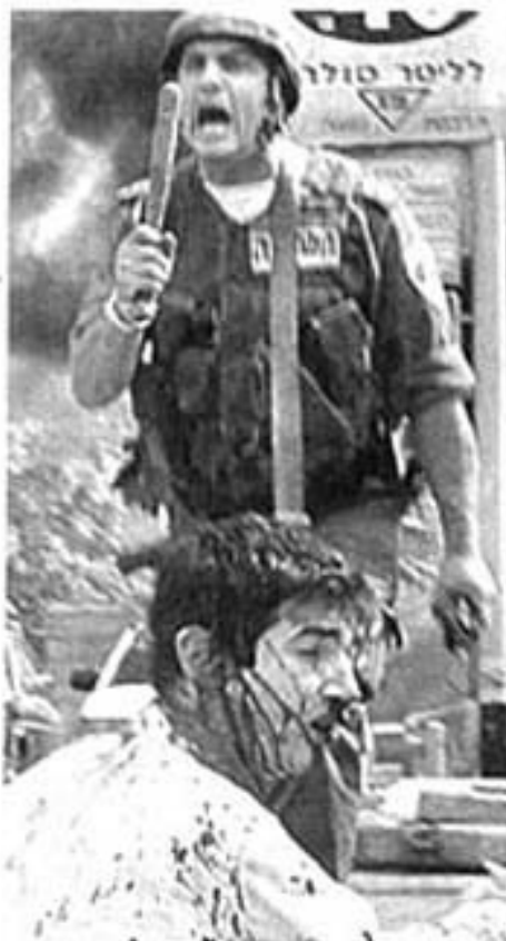
An Israeli policeman and a Palestinian on the Temple Mount.